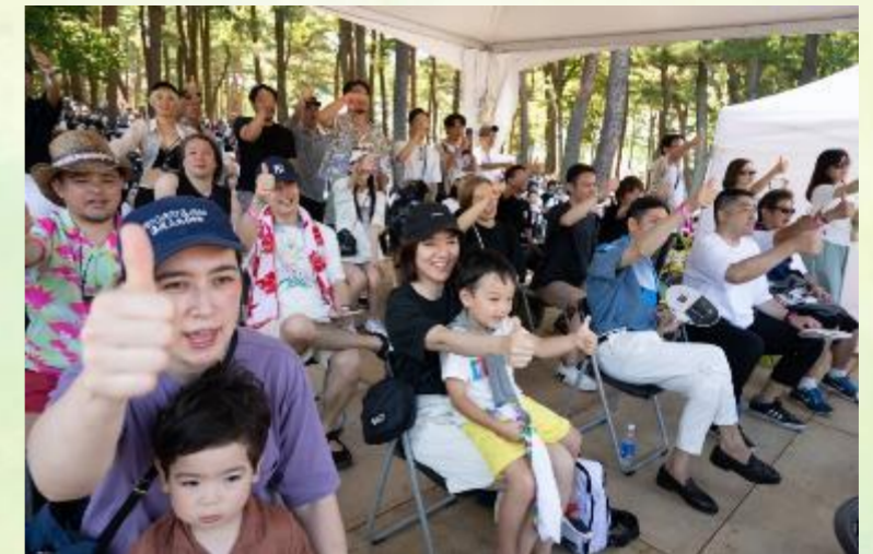
*For reference (last year's set up)