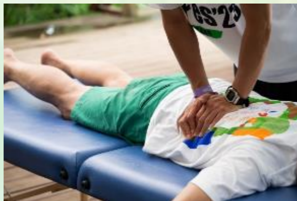
*For reference (last year's set up)