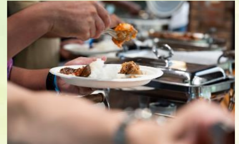
*For reference (last year's set up)