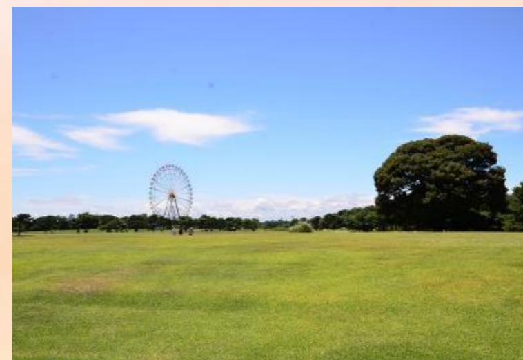
(Photos from festivals sponsored by other companies that were held on the grassland in the past)

Dates: Sat. July 13th, Sun. July 14th, Mon. July 15th, 2024