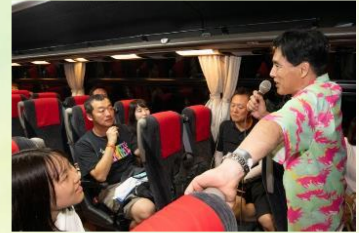
*For reference (last year's set up)